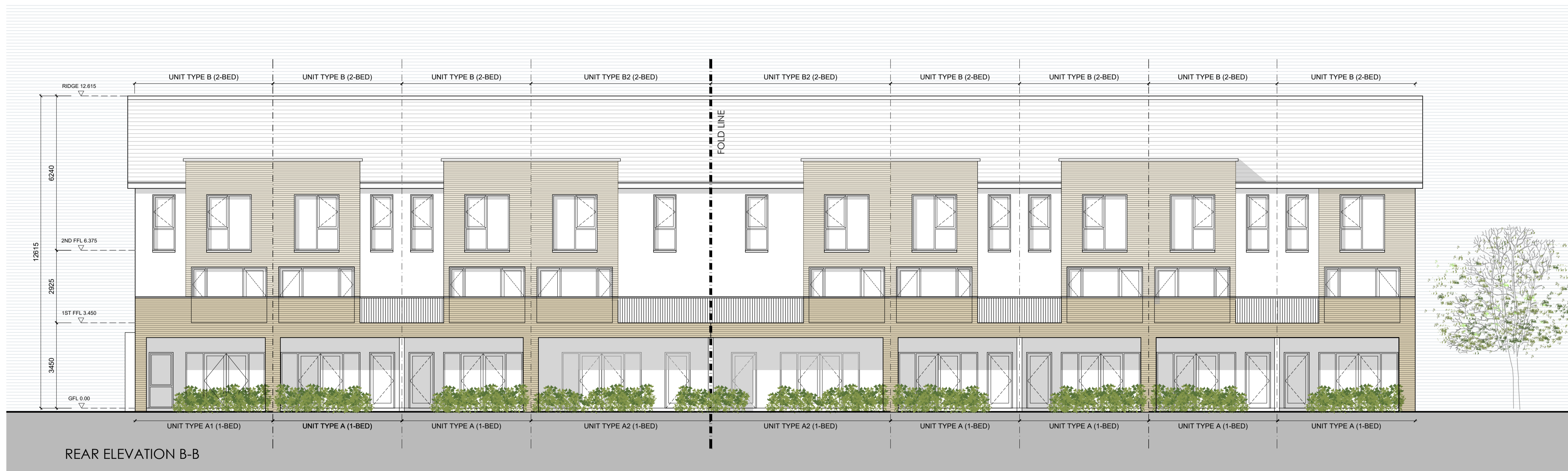
REAR ELEVATION B-B