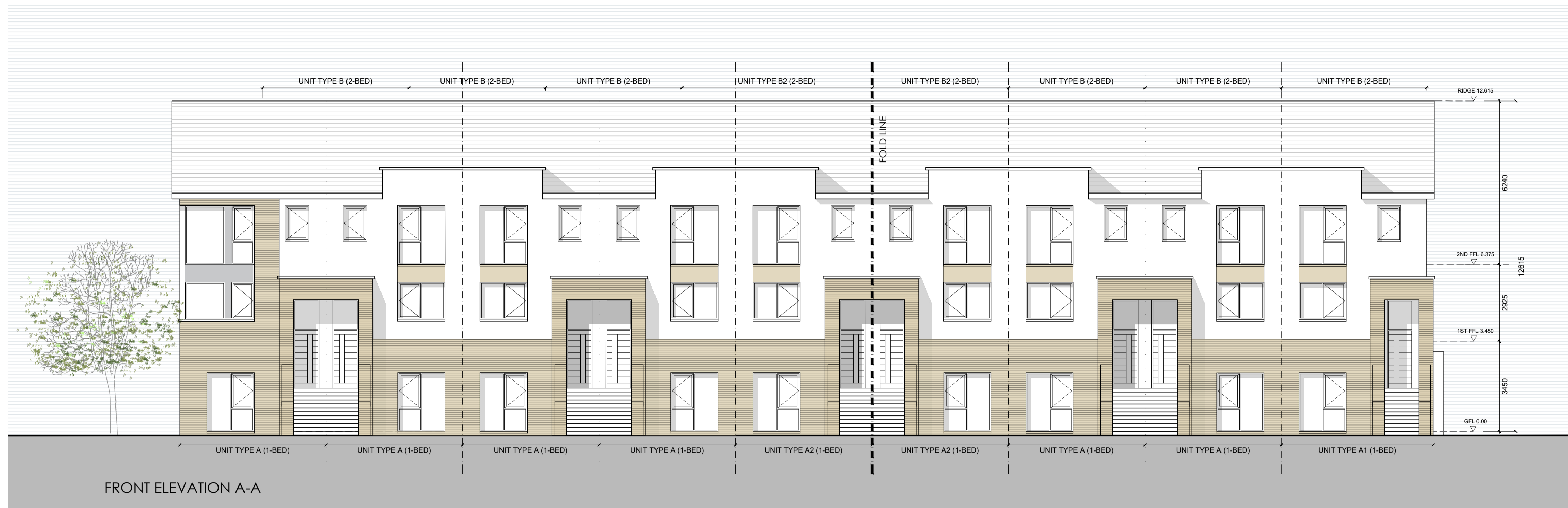
FRONT ELEVATION A-A